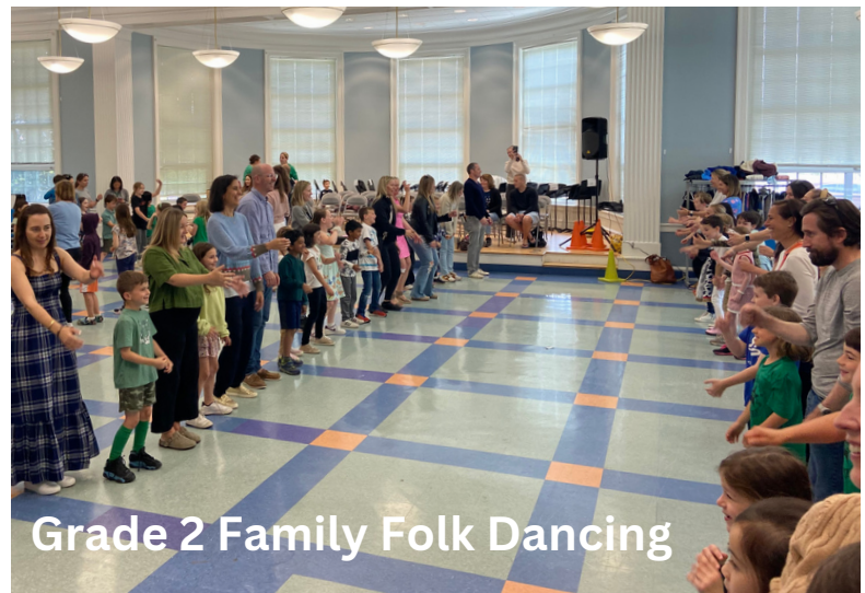
Grade 2 Family Folk Dancing

This Tuesday, our school community will come together to honor those who have served with our armed forces. The Memorial Day Ceremony will take place on our football field at 9:00am and we encourage our community to wear red, white, and blue. This annual tradition is filled with songs. Families are welcome to attend. The event is rain or shine.